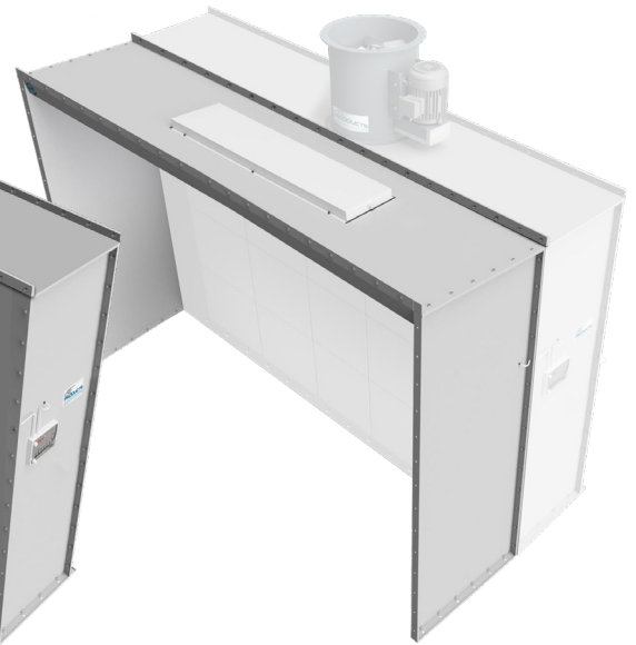
Open Face Paint Booths

To see the full line of products, visit our website: CNCProductsInc.com