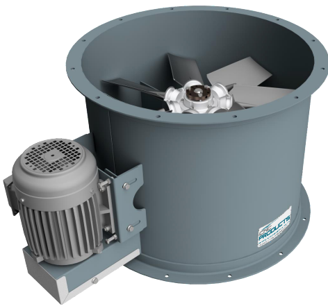
Belt Driven Tube Axial Fans