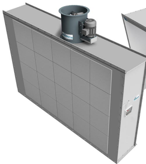
Exhaust Paint Walls